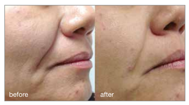
Fotona4D® procedure: courtesy of Adrian Gaspar, MD

A light cold Er:YAG ablation that gives a pearl finish to the skin. SupErficial<sup>™</sup> additionally improves the appearance of the skin and reduces imperfections by using propriety VSP technology, enabling the operator to easily adjust the laser to an extremely controlled light peel, without thermal effects, for a no-down time, precise treatment.